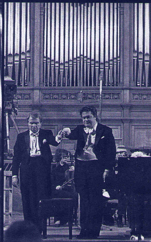
Symphony concert at the Large Hall the Moscow Conservatory Soloists - Vladimir Ovchinnikov Emil Gilels